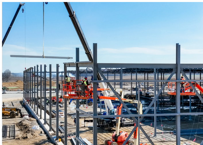
Approximately every 3 days, Woodward was able to erect steel to accommodate 12,000 sf of decking. The result of this approach was completing the contract 11 weeks early, allowing the rest of the trades to proceed sooner, and the owner started placing case logistic equipment to start operations faster.

With structure on critical path, Woodward set to get ahead and stay ahead of schedule. Even with the challenges of working near other trades, and having to change erection sequences regularly, WSG completed its scope ahead of schedule and under budget. Approximately every 3 days, Woodward was able to erect steel to accommodate 12,000 sf of decking. The result of this approach was completing the contract 11 weeks early, allowing the rest of the trades to proceed sooner, and the owner started placing case logistic equipment to start operations faster.